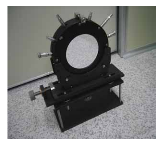
Fig.1 Fabricated parallel plate ionization chamber had double BNC connectors, SHV connectors and gas quick connectors.

Fabricated parallel plate ionization chamber for proton beam calibration is show in Fig. 1. This consists of a guard electrode and subassemblies that are represented by windows, pad-quads and electrodes. Guard electrode is for intercepting current flowing from potential electrode to collecting electrode [1, 2]. Material of windows and electrodes used in ionization chamber was chosen to minimize the beam loss in magnitude because proton beams must pass through them without any loss of energy. Active area and collecting volume of fabricated ionization chamber were 471 mm<sup>2</sup>, 371.1 cc respectively.