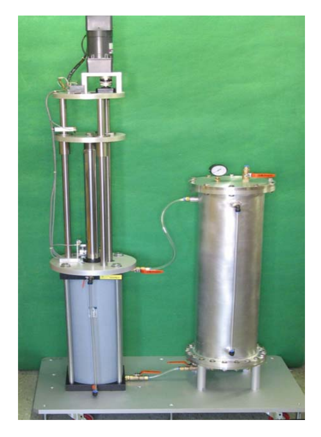
Figure 3. Fabricated test pot of the cylinder type stub

fabricated and tested. The speed of the motion of the liquid surface is now 4.6 mm/sec with 1:30 rated gear. It can be increased by changing the deducing gear ratio. Fabricated test pot of the cylinder type stub is shown in Figure 3.