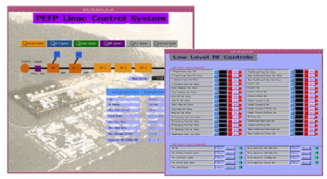
Fig. 2 Main of PEFP control system

We concluded that EPICS (Experimental Physics and Industrial Control System) is a suitable tool which can be used to develop a control system that satisfies the above requirements and decided to use it for the PEFP linac control system development. Figure 2 shows a main control picture using MEDM tool.