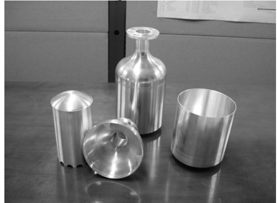
Figure 3. Shape of manufactured moderator cell

assembly region about cylindricality, welding region common difference, length common difference etc.