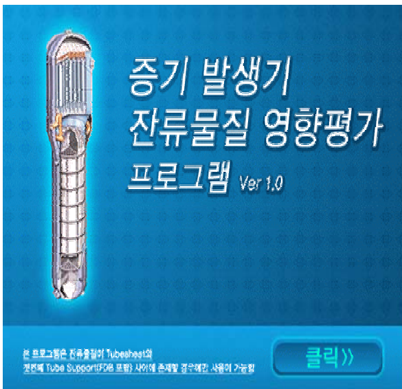
Figure 2. Main Window for Program Evaluating the Effects on the Secondary Side of Steam Generator due to Foreign Objects