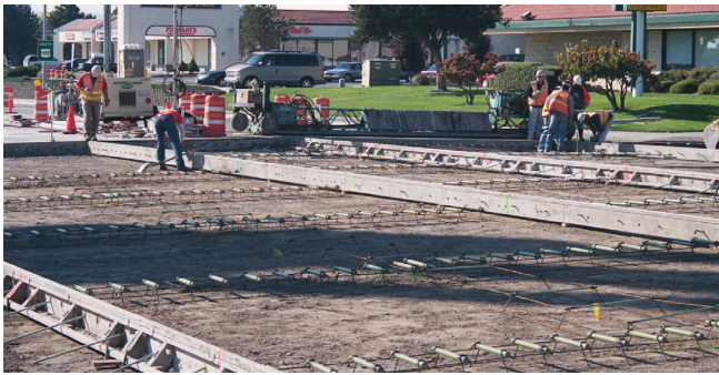
Figure 3. Setting forms and installation of dowel bar baskets

Construction of PCCP intersections requires some type of fixed-form construction to accommodate short paving segments, varying paving widths, and curved paving areas. The forms were placed to allow placement of the PCCP with roller screeds. Figure 3 shows the erection of forms. Dowel bar baskets were pre-fabricated with ten epoxy coated dowel bars per joint and were placed between the forms.