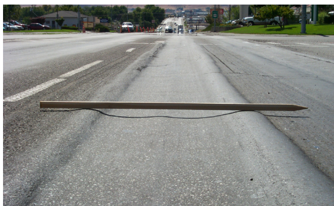
Figure 1. Severity of pavement rutting at an intersection

maintenance, minor ruts reappeared after a few months with severe ruts within a year after rehabilitation. Figure 1 depicts the level of severity of pavement rutting at an intersection. The purpose of this reconstruction with PCCP was to provide a quality long-life pavement with minimal user disruption which will result in safety improvements and a significant reduction in user costs.