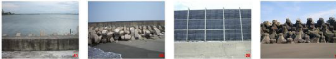
2.34/0.86 【41】 2.33/0.91 【40】 2.33/1.02 【28】 2.32/0.98 【01】