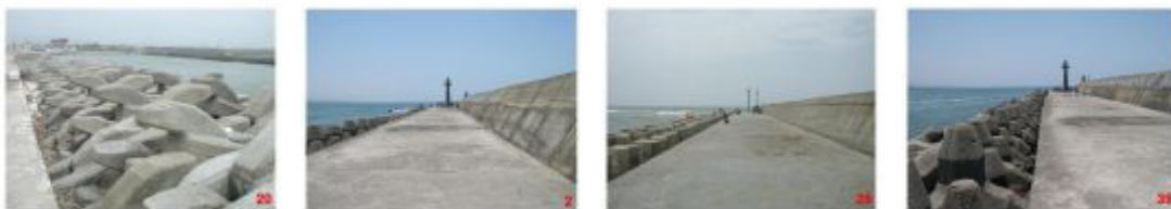
2.50/1.07 【20】 2.48/0.83 【02】 2.44/0.89 【25】 2.43/0.85 【39】