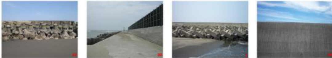
2.30/0.89 【52】 2.30/0.85 【30】 2.27/0.92 【03】 2.24/1.08 【59】