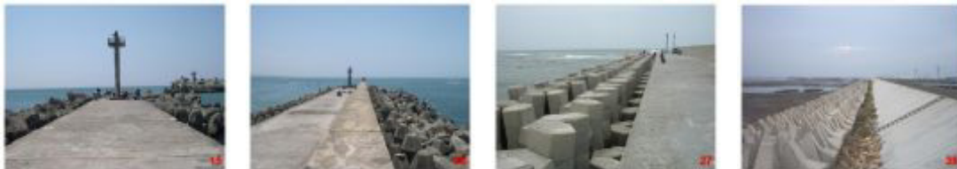
2.66/0.84 【15】 2.65/0.87 【50】 2.64/0.89 【27】 2.61/1.03 【38】