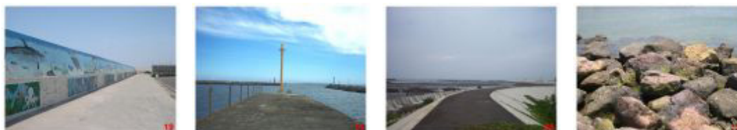
3.15/1.09 【19】 3.14/0.95 【14】 3.10/0.95 【35】 3.04/1.17 【33】