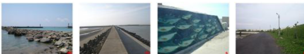
4.29/1.07 【48】 3.24/0.99 【22】 3.22/0.98 【09】 3.22/0.92 【08】