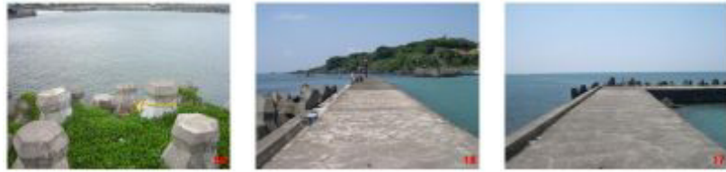
2.81/0.98 【58】 2.80/0.95 【18】 2.77/0.94 【17】