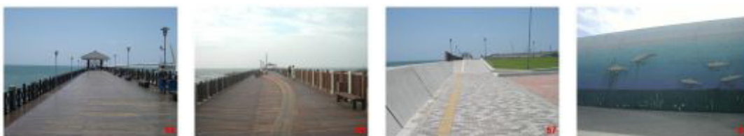
4.00/1.035 【55】 3.79/0.99 【45】 3.523/1.15 【57】 3.42/1.05 【23】