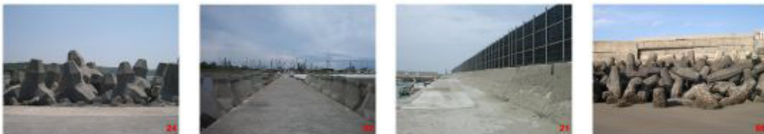
2.21/0.86 【24】 2.16/0.92 【32】 2.14/0.88 【21】 2.07/0.92 【56】