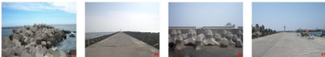
2.37/1.09 【06】 2.72/0.94 【44】 2.36/0.94 【43】 2.36/0.87 【31】