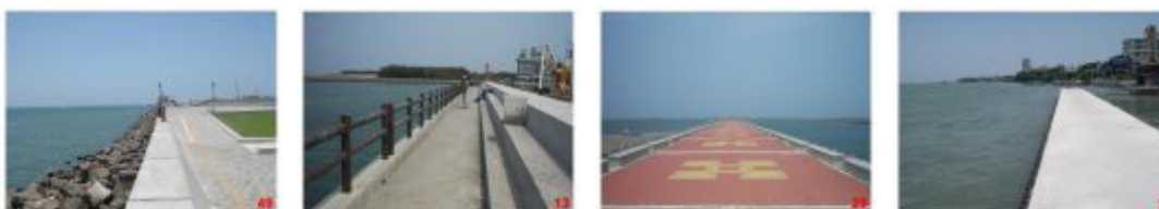
3.41/1.07 【49】 3.36/0.99 【13】 3.35/1.14 【29】 3.30/0.94 【07】