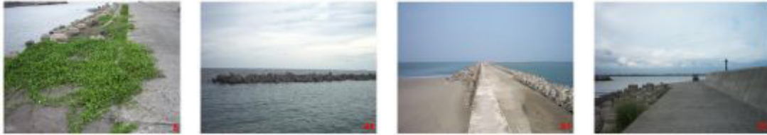
2.75/0.94 【05】 2.70/1.01 【34】 2.69/0.92 【51】 2.67/0.82 【37】