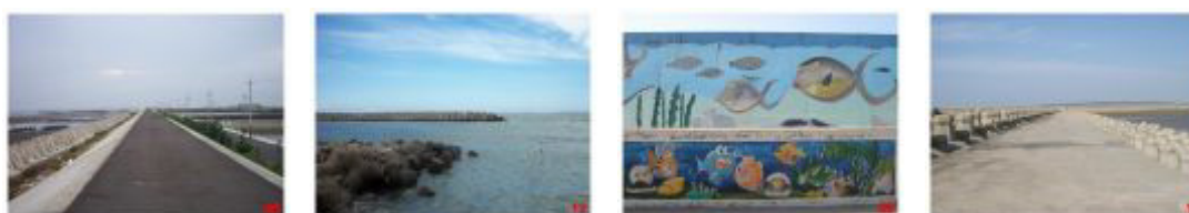
3.02/0.90 【46】 2.97/0.99 【12】 2.96/1.11 【36】 2.95/1.13 【16】