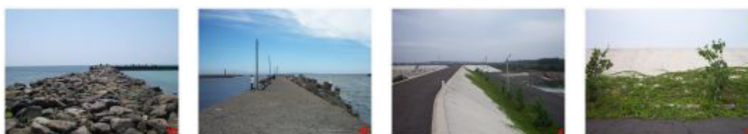
2.95/1.06 【10】 2.93/0.97 【47】 2.92/0.93 【04】 2.90/0.92 【42】