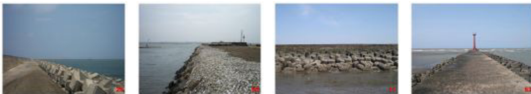
2.59/0.88 【26】 2.58/1.01 【60】 2.54/0.89 【11】 2.50/0.87 【53】