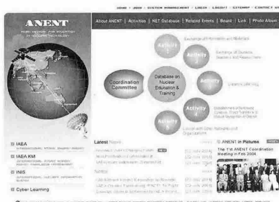
Figure 3. The front menu page of the ANENT website

As part of the group activities of the IAEA's program on ANENT, KAERI has established a website ( www.anent-iaea.org ) as shown in Figure 3, where the image of front web-page highlights "NET DB" and the group activities which are inter-connected. The required information and material for nuclear education and training is being collected and loaded onto the database. Also, being given great attention is the link of the ANENT website with relevant sources. The website is to be improved step-by-step, while its effective and sustainable operational system will be secured so that the intended web-based networking within the ANENT framework can be accomplished.