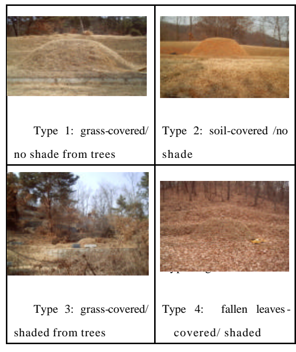
FIG. 2. Graveyard types: the ground truth

Object-oriented classification algorithm for feature extraction was researched in this project theoretically. And we did a pilot project that was performed with mixed methods.