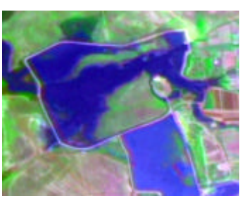
Fig.2. Fusing image of Landsat-TM and Indian-IRS