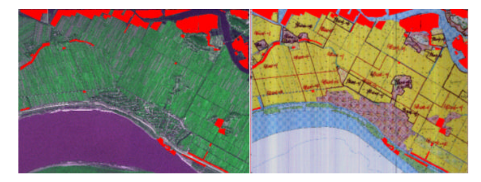
Fig.3 Object-oriented change information automatic extracting (red region) and updating land use map (right)