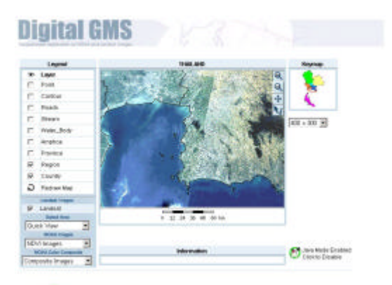
Fig.3. Direct interface to mosaic of Landsat 5 image

Without both of improvement of algorithms, the speed of response time is very slow or sometime lost connection while wait a resample process on server side. The improvement is very successful. Consequently, the return response time is acceptable around 3 or 4 seconds even loading the entire area. Te main objective of the improvement is to speed up of the response time while preserving the data quality. As a result, a user can more clearly distinguish around the interesting area from RS data incorporated with GIS data and zoom into actual pixel size of remote sensing data.