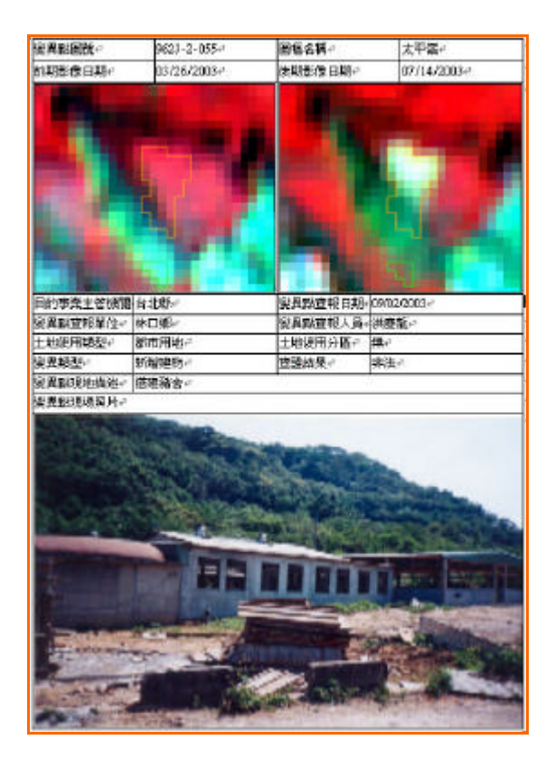
Fig 4.Response form filled by the field investigator.