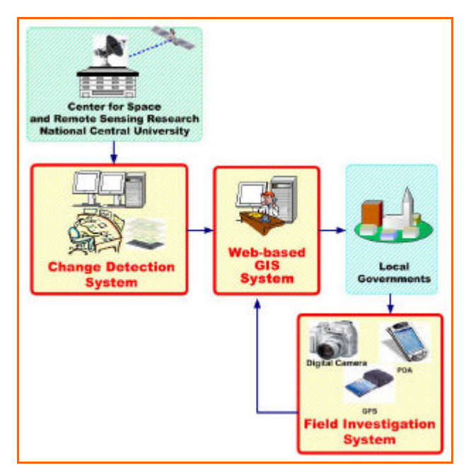
Fig. 1 Infrastructure of the National-scale Land use /Land cover Change Detection System

The constituent structure of the system can be diagrammatized as Fig. 1.