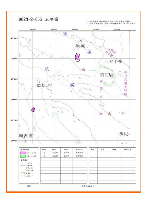
Fig 1. The map of changed points.

After a series of tests and experiments conducted between central and local governments, the system has been executed fluently. One of the practical illegal cases found out by the detecting system this year is illustrated in Figs. 2, 3, 4 and 5. Fig. 2 demonstrates the changed areas overlaid with the digital maps, the map tells coordinates to lead the investigator to the changed place. Fig. 3 and Fig. 4 are the satellite images proving the variance. Fig. 5 is the documents respond by the investigator on the web-based system, which shows the dates of image reception and survey, the name of the agent, the statement and the photo. In this case, a farm house is built up without permit.