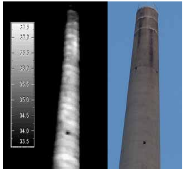
Fig. 5. Thermal infrared images of Hario Radio Tower

In this study, Authors studied the historical structures in Kyushu region. Some analysis results clearly show the temperature change and the portion considered to have deteriorated was shown in surface distribution or surface temperature change. As a result of this study, we have found useful guidelines in developing methodology to conduct diagnosis of historic buildings by using thermal infrared camera. In order to modernize the historical inheritances, it is highly suggested to continue research work. By doing this, it not only helps us to make proper judgments on the degradation state of historical inheritances, but also to improve the maintenance management.