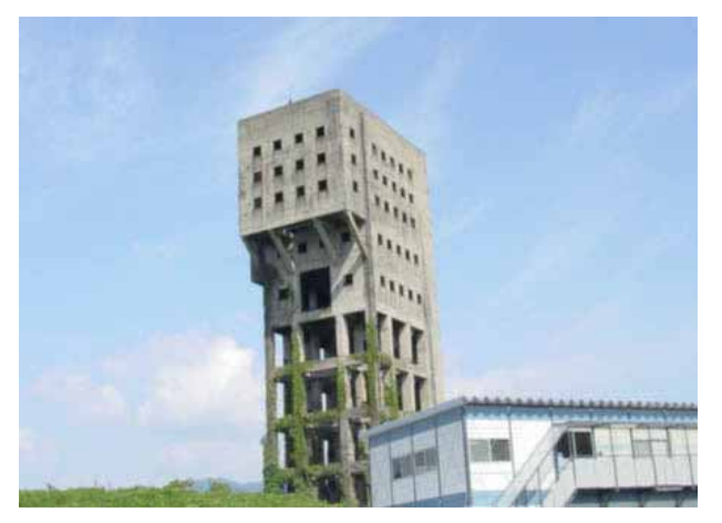
Fig 2. Vertical Shaft Oar of Shime Coal Mine

winding tower type vertical shaft. Currently it is in the possession of New Energy and Industrial Technology Development Organization, Japan. The vertical shaft oar of the Shime Coal Mine image is shown in Fig.2 .