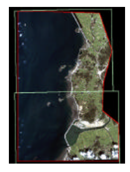
Fig. 2. Sample Image.

The final objectives of "Development of High Resolution Satellite Image Processing Technology" are developments of technologies and component-based software for the high-resolution satellite imagery, retention of high-level technologies for KOMPSAT-2 satellite which will be launched in 2004, and stimulation on the related industries. High resolution satellite images will be extensively utilized to acquire the geographic information and the needs for high value-added information production using satellite imagery are more increasing now. Also, component-based image processing software are required in satellite image processing fields because component-based software are easy to maintain and upgrade, and able to reduce the software developments periods.<sup>[1][2]</sup>