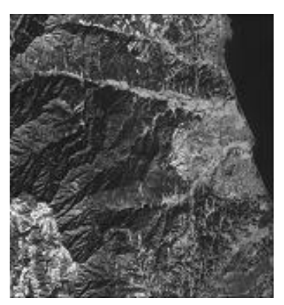
Fig. 1. KOMPSAT EOC data.

Figure 1 and 2 are shown stretched images of Kompsat EOC and Spot-5 PAN images.