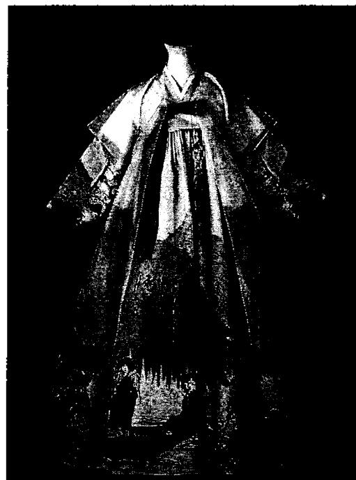
<Fig. 3> "Reappearance"