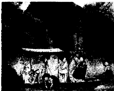
<Fig. 1> The Original Painting.

Several techniques were used to create this garment. The selected original painting(Fig. 1) was used and converted digitally using the Design CAD software applications named Texpro and Photoshop(Fig. 2). On the non-patterned silk crepe de chine, the converted pattern was printed on the bottom area of the skirt and outside of the sleeves, using the digital printing software applications, ProofMaster and the digital printing hardware, DTP Link system. On the other areas of the garment including Goreum the pastel yellow and blue colors were printed by the DTP system. And the Korean traditional textile, Nobang was used in the outer garment called Kweja. Several construction techniques were combined to create this ensemble design(fig. 3), and the finished ensemble is sophisticated, fantastical, and calm. It is an ensemble that women who love Korea would like to have and wear.