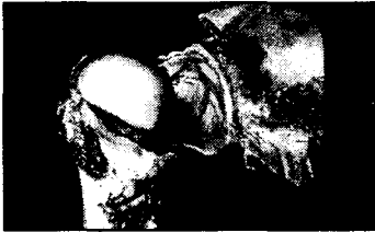
TURKEL et al. JBJS 1981